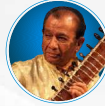
Ustad Usman Kha International Sitar Player