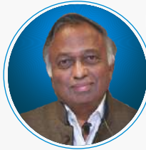
Dr. Vijay Bhatkar Padmabhushan