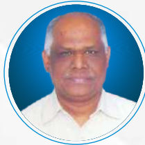
Dr. R.V. Jahagirdar Sakshi Trust Bengaluru