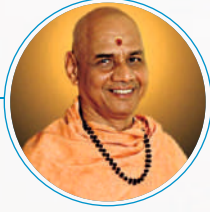
P.P. Swami Govinddev Giri Treasurer, Ram Janmabhumi Trust