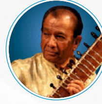
Ustad Usman Kha International Sitar Player