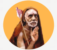
P.P. Paramacharya Mahaswamy Kanchi Kamkoti Peetham

"Human beings everywhere should learn, understand and grasp the noble knowledge from divine Rishis and Sages from Bharatavarsha and apply the same to acquire every kind of prosperity and happiness in their material as well as spiritual life." Inspired by these words, Bhishma School of Indian Knowledge System conducts courses in the broad discipline of Indology, beginning with Vedic heritage and includes the whole spectrum of Indian Knowledge Systems (IKS).