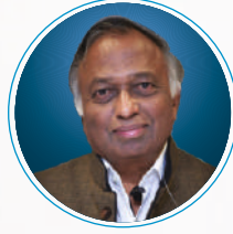
Dr. Vijay Bhatkar Padmabhushan